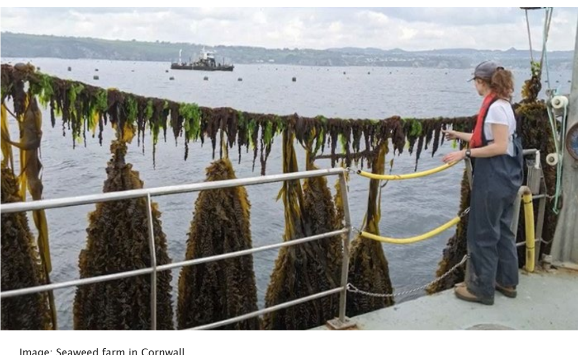
Image: Seaweed farm in Cornwall