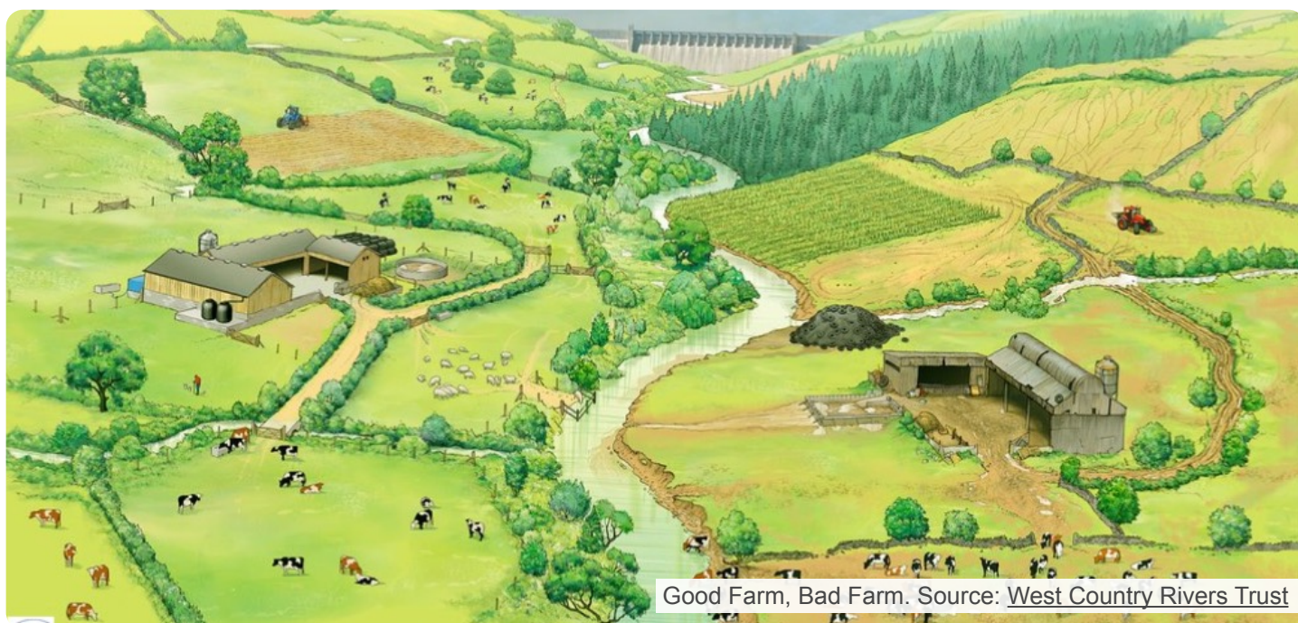
Good Farm, Bad Farm.