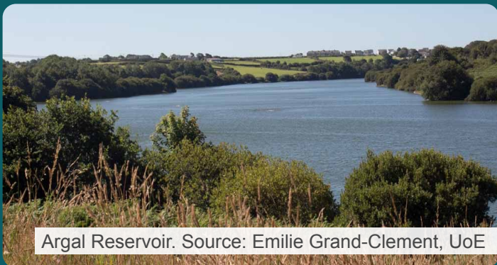
Argal Reservoir.