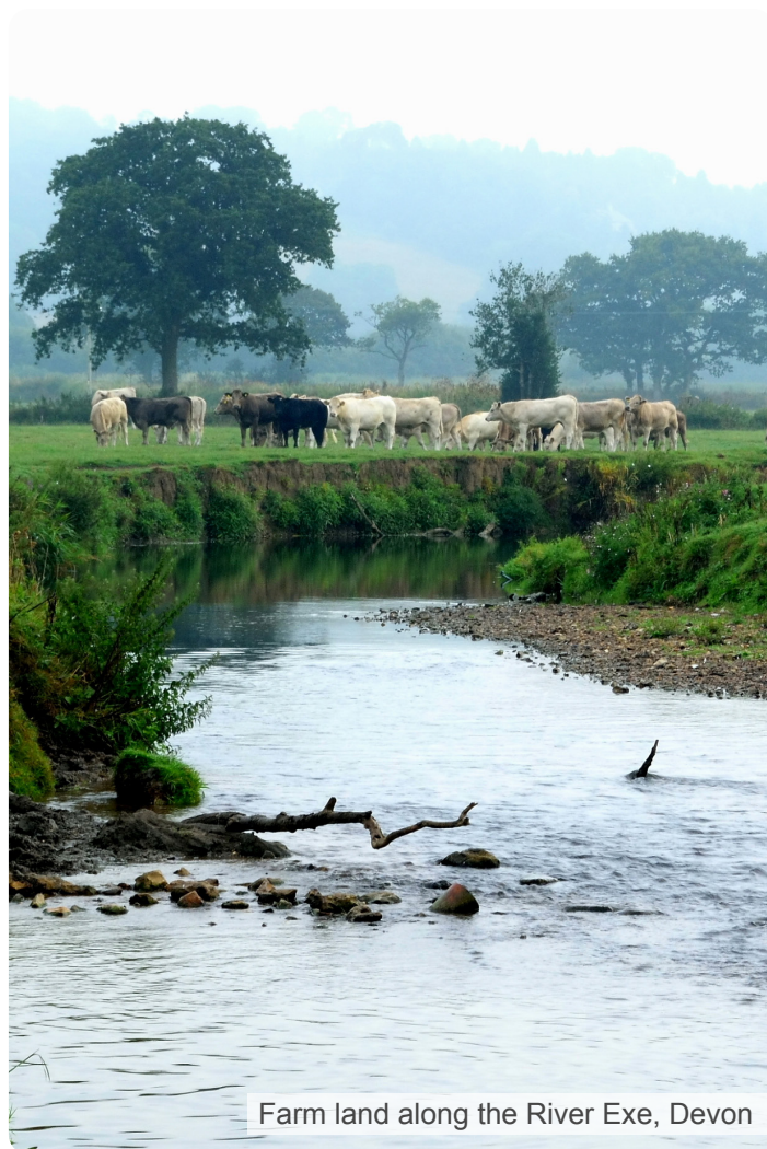
Farm land along the River Exe, Devon

It can also do this at far less cost compared to over engineered solutions which remove pollutants in water treatment works, and generally require multi-million pound investments. The programme supports farm advisers who work closely with landowners to advise on water friendly farming practices.