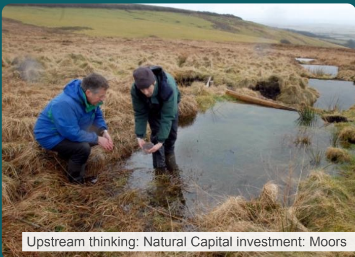
Upstream thinking: Natural Capital investment: Moors