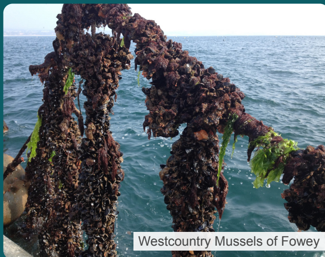
Westcountry Mussels of Fowey