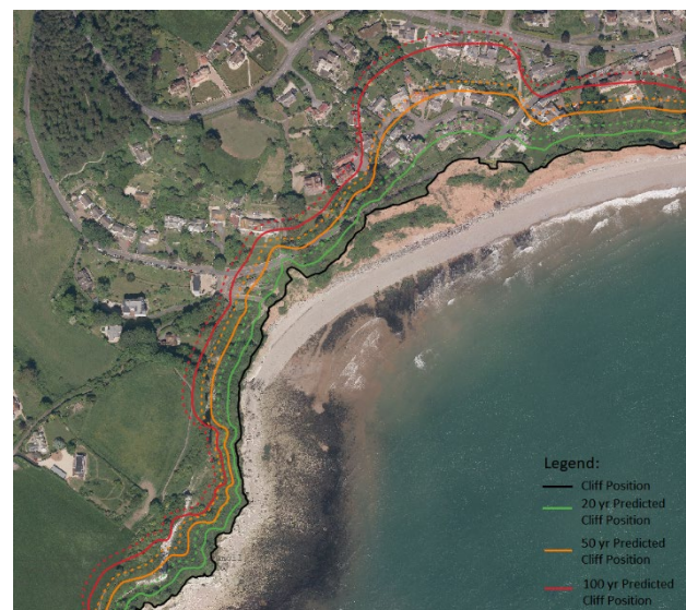
Projected future cliff position for different epochs; buffers allow uncertainty to be visualised.

To find out more see the SWEEP website or contact Dr Tim Poate timothy.poate@plymouth.ac.uk