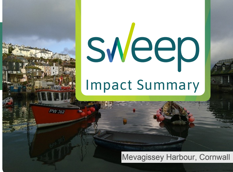
Mevagissey Harbour, Cornwall

1 new Marine Advisor job supported by £20k leveraged funding